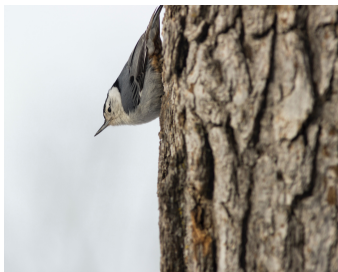
A secure food cache