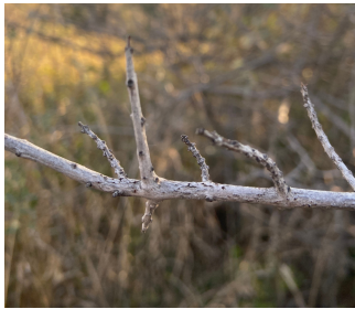
Straight branches for making arrows

TODAY THE GRASSLANDS ARE A CONSERVATION AREA BUT REPRESENT WHAT SASKATOON LOOKED LIKE BEFORE TREATY 6 BEGAN. CAN YOU READ THE LANDSCAPE TO FIND SHELTER, FOOD AND WATER?