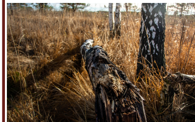
An animal trail