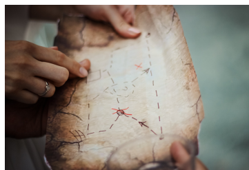
Direction to the river