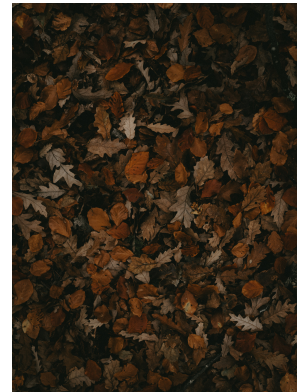
A hiding spot