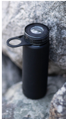
A water source