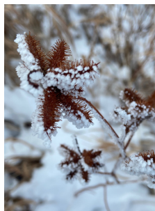
A burr like velcro